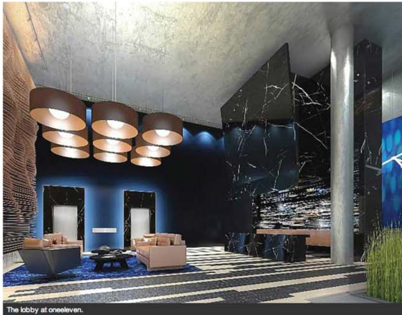
The lobby at oneeleven.

Special to National Post Apr 9, 2012 – 2:00 PM ET | Last Updated: Apr 10, 2012 9:05 AM ET